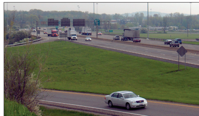
SR 18/IR 77 Interchange

The Study is located in Bath and Copley Townships of Summit County. The Study Area closely follows the SR 18 Corridor, from Medina Line Road east to Interstate 77, including the IR 77 interchange and then continues south along IR 77/SR 21 to and including the SR 21 interchange.